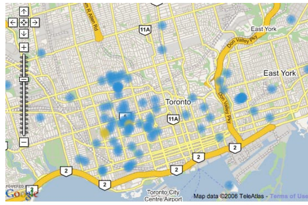
Wireless Nomad Toronto WiFi Locations